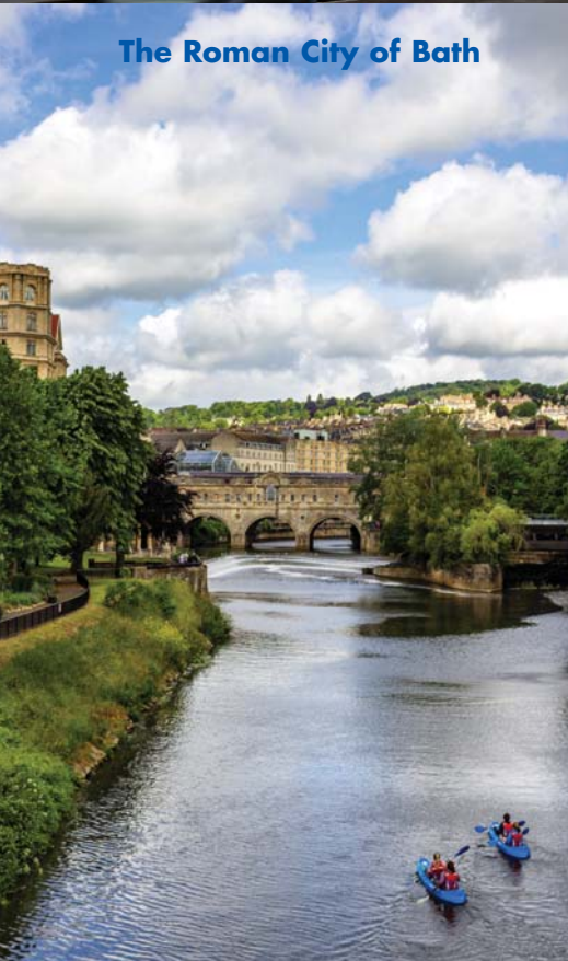
The Roman City of Bath