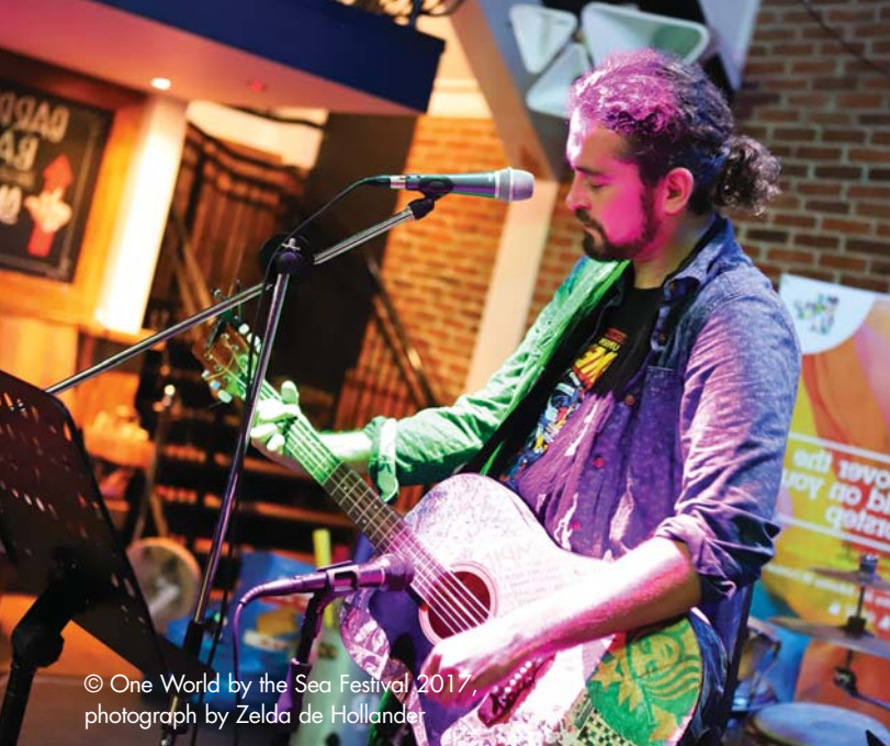
© One World by the Sea Festival 2017, photograph by Zelda de Hollander